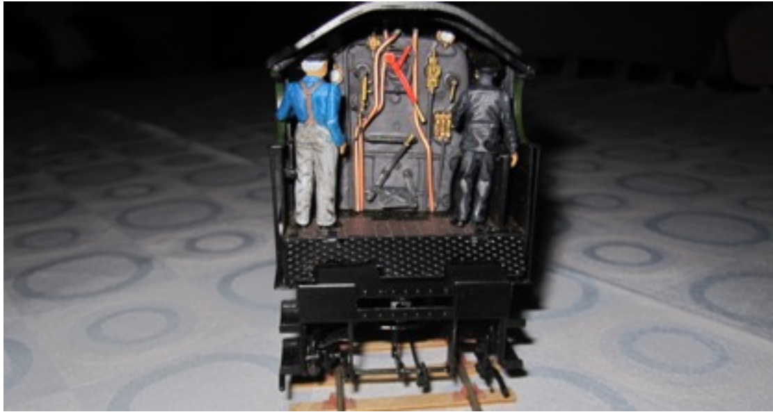
Cab interior. The fireman's shirt is LNER Garter Blue!