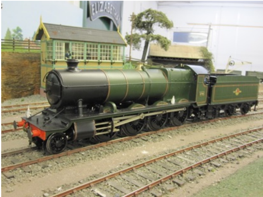
The other side photographed on the Elizabethan Railway Society 7mm layout at Sutton in Ashfield Nottinghamshire.

Now a Great Western Toad brake van is required for the other end of the train when it hauls one.